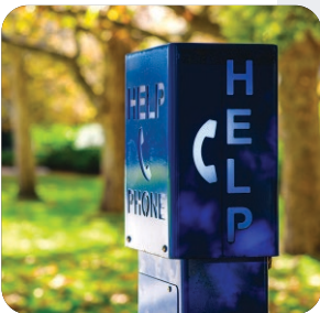
Emergency Call Box