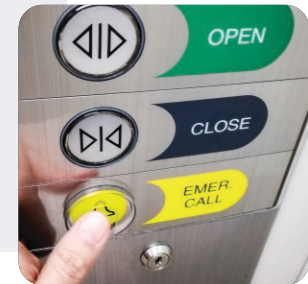
Elevator Call Box

Introducing the ONLY Enterprise-Grade Router That Simultaneously Leverages Both the Voice and Data Networks for POTS Line Replacement.