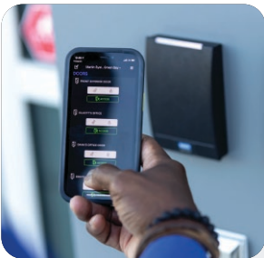
Security & Access Control